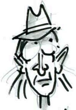
DAVE who hates dogs did the cover